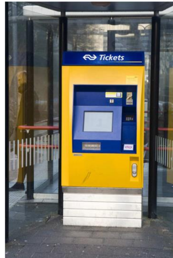
Fig. 2: NS card machine.

On the train stations, you can find machines where you can buy paper tickets, anonymous OV- chipcards and where you can recharge your personal OV-chip card (Fig 2). You can choose English as language and you will be guided through the process. More methods to load your personal OV-chip card can be found at: OV-Chip . Pay attention to the fact that you cannot buy a train ticket on the train itself. If they catch you without tickets or you haven't checked in, you have to pay for the ticket together with an extra fine of € 50.