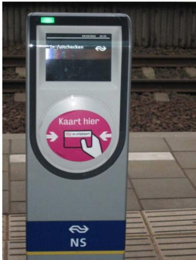
Fig. 1: Pole to check in and out.