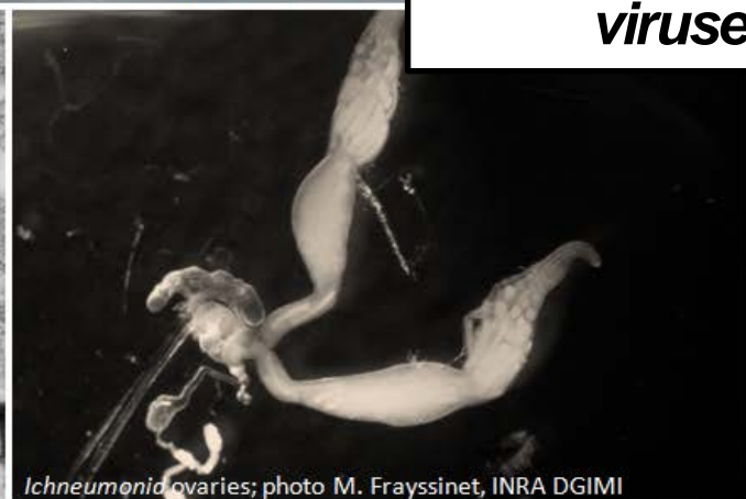
Ichneumonid ovaries

+ workshop for HBO, MSc, and PhD students Are Ichnoviruses real viruses?