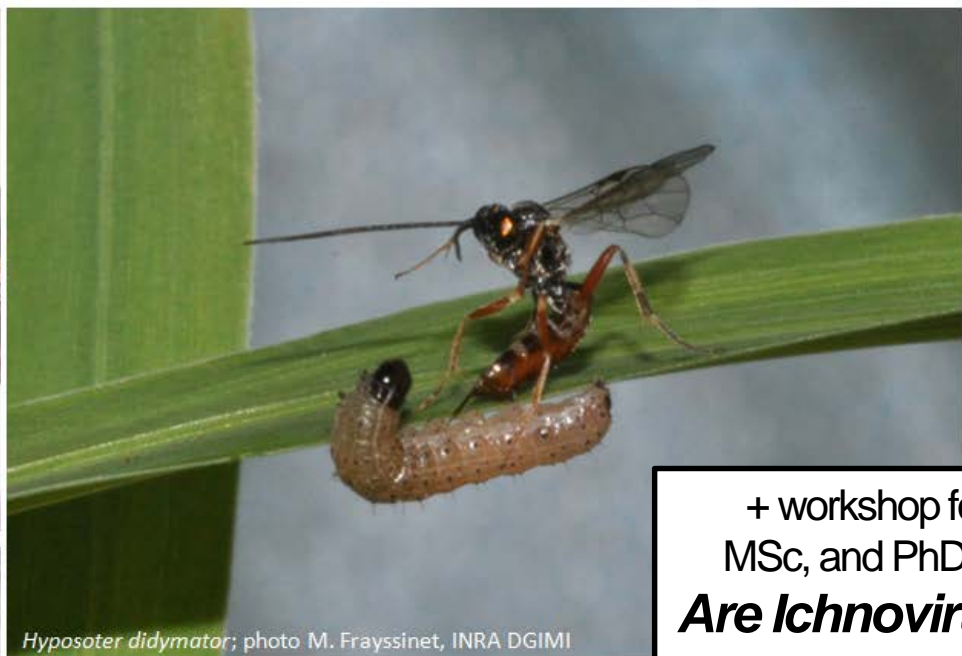
Hyposoter didymator